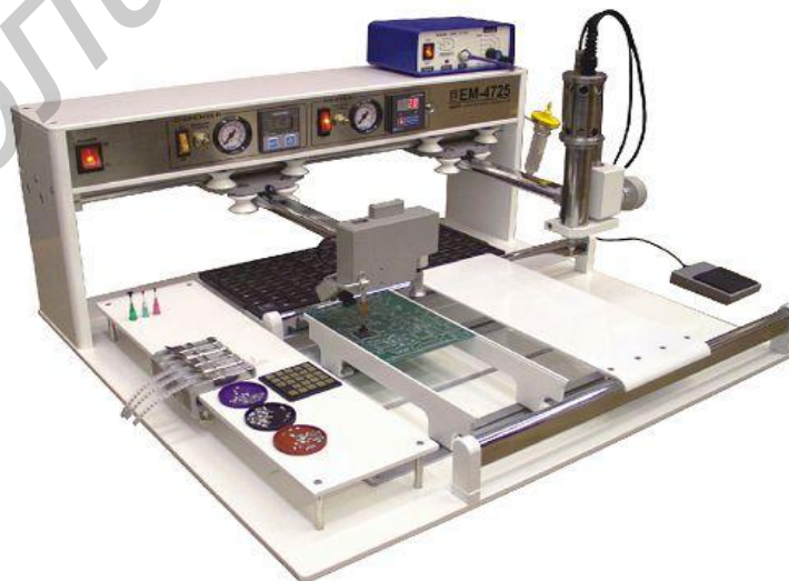
Fig. 1. Surface mount manipulator EM-4725 (Belarus)

The manipulator can be supplied with belt, cassette or carousel feeders. The belt feeders provides the component feed, packed in blister-belt, with the help of spinning bobbin. The cassette two-deck feeders are designed for storing SMD in belt snips. The maximal concentration of different SMD types can be achieved by the two-deck configuration. Carousel feeders are designed for storing SMD in scatters. The carousel is mounted on ball bearing and spins in both directions with the help of handle.