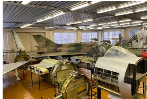
Figure 1. Aircraft class

use: Ontology for Virtual Human. The conceptualization step is to identify a body in the knowledge domain and to clarify the conceptual nature (concepts, relations, properties and relations of concepts, rules, constraints, etc.) The ontologization step consists in modeling in a formal language the domain properties, the objective is to obtain a model in which almost all the ambiguities inherent in natural language are lifted. Without ontology based concept people won't be able to get full experience of VR and AR In Samara Students study how an airplane works, develop an ontology of a given subject area [5]–[7], and build 3D models of airplane assemblies. The work is aimed at the application of these models. There is a class containing both decommissioned aircraft units and operating earlier aircrafts, figure 1. Such as the Yak-26, MiG-21, Su-15 and others. It helps students to get a better understanding about aircrafts. Students also create