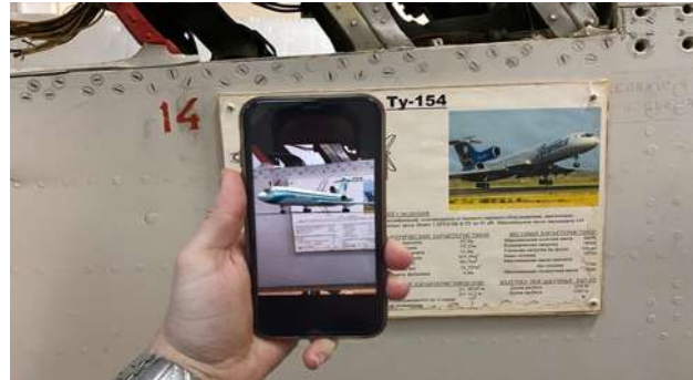
Figure 3. Augmented reality, 3D-model of the Tu-154

the skin of the aircraft and demonstrating its power elements, breaking it into separate units, into separate 3D objects.