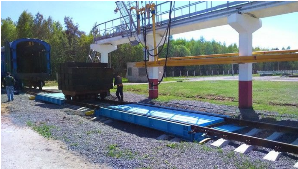
Fig. 4. General view of the installed railway scales