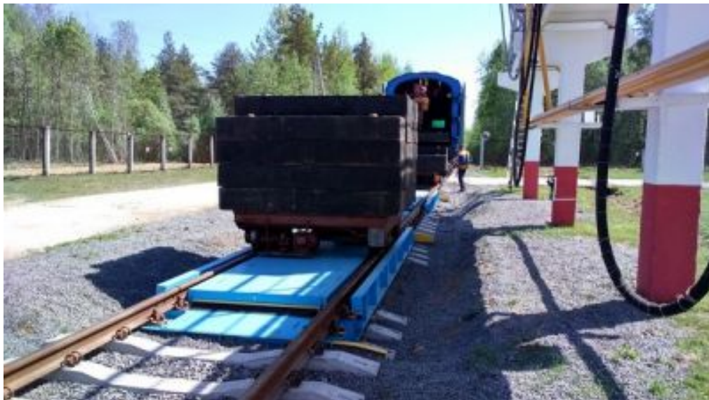
Fig. 3. Calibration of scales of a weight-measuring wagon

Figures 3-4 shows the general view of the installed scales.