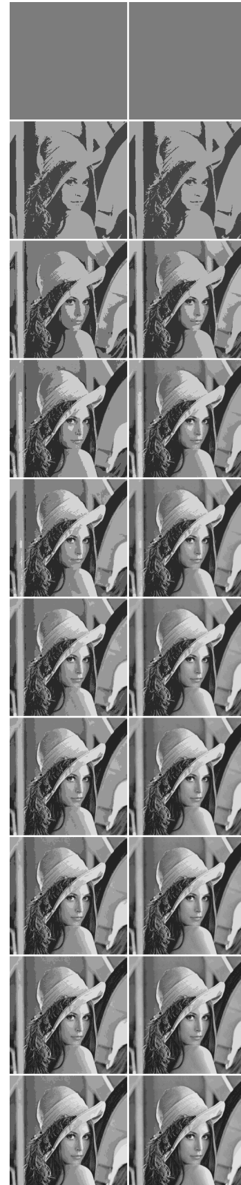
Fig. 2. Sequences of optimal (left) and superpixel (right) approximations of “Lena” image.

which implies proper ordinate \sigma \rightarrow E \sim \sigma^2 transformation for the bottom graph in Fig.3.