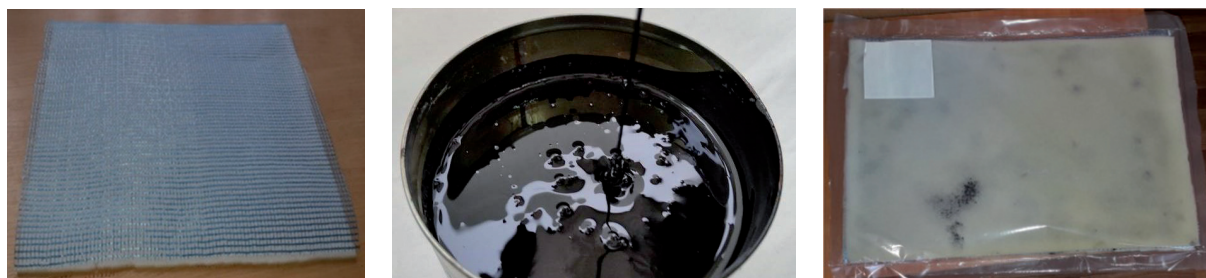
Fig. 1. Illustrations of the results of the developed technique main stages implementation