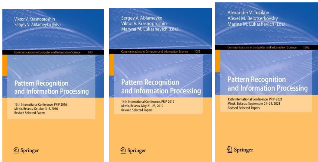
Figure 2. Proceedings of some PRIP conferences.