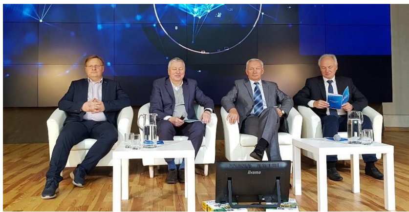
Fig.3. Opening of the 15th PRIP in 2021. IUIIP NAS of Belarus.

PRIP is carried out in turn by three leading scientific institutions in Belarus: the Belarusian State University, the Belarusian State University of Informatics and Radio Electronics and the Joint Institute for Informatics Problems of the National Academy of Sciences of Belarus.