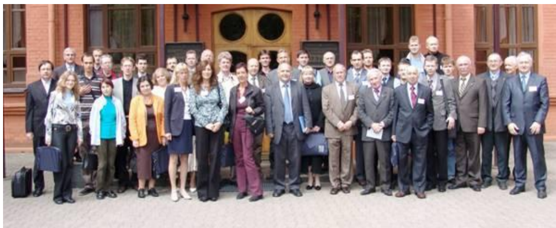
Fig. 1. Conference PRIP 2009. BSU.