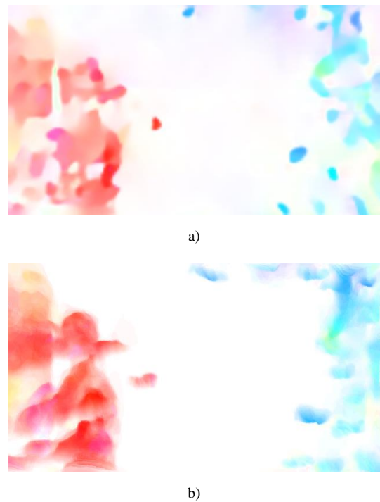
Fig. 2 Visualization of the optical flow between frames 1 and 2 (a) and frames 1 and 6 (b)

To visualize the directions of the flow branches, a pixel density was chosen - the ratio of grid node pixels to the total number of pixels. High density makes the vectors small and covers a very large percentage of the frame (Fig.3a), whereas small density leads to greater accuracy, but potentially also cause loss of pixel groups and fluctuations (Fig. 3b).